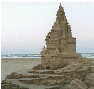
Little Lindsay Little

That little one is quite talented. But we can't help but wonder, when will she become “Big Lindsay Little”? Or “Big Lindsay Big”? Or What??????